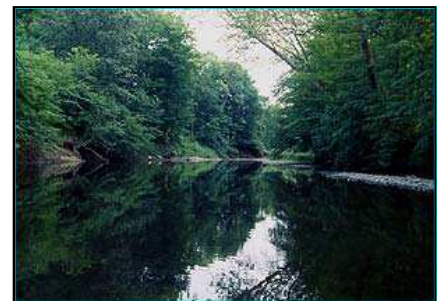
The Pomperaug in summer